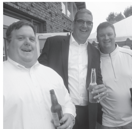
Spreading around randon shots from last week for your viewing pleasure